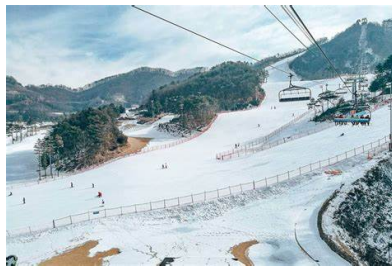
*Oak Valley Ski Resort