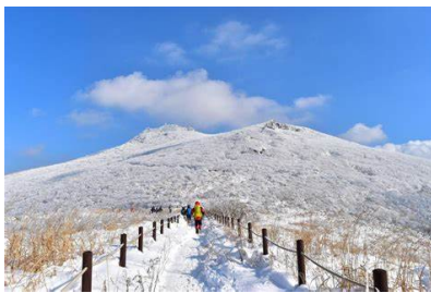
*Mudeungsan National Park