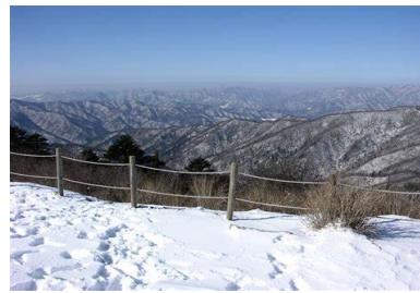
*Odaesan National Park

*72 hrs prior to departure: Families available for registration