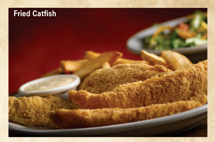
Fried Catfish Lightly breaded in southern cornmeal and deep-fried to a golden brown .......(3-piece) 15.49